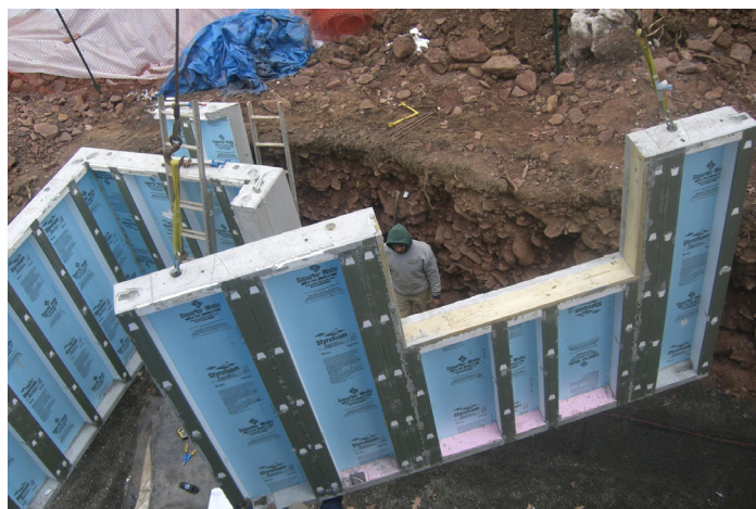
Superior building envelope