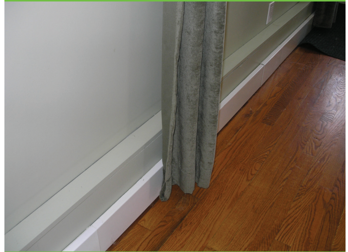
European flat panel radiant baseboard