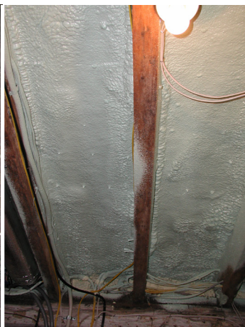
Expandable spray foam insulation*

*To avoid fire hazard when using spray foam materials installed in walls or ceilings, choose an approved, fire resistant thermal barrier with a finish rating of not less than 15 minutes as required by building codes. Rim joists/header areas in accordance with the IRC and IBC, may not require additional protection. Foam plastic must also be protected against ignition by code-approved materials in attics and crawl spaces. See relevant Building Codes and www.iccsafe.org for more information.