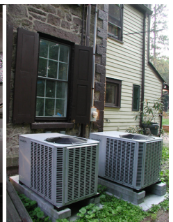
All climate heat pumps