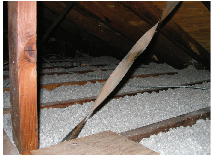
Blown cellulose insulation in attic