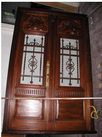
Salvaged front doors