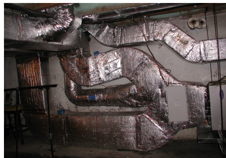
Ductwork sealed and insulated