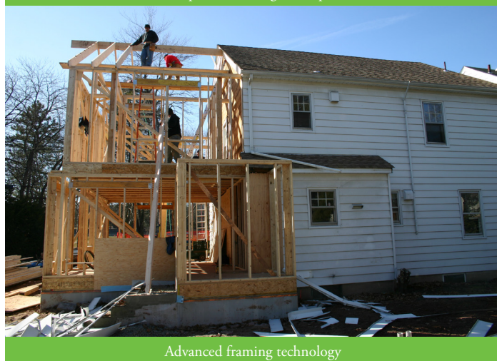
Advanced framing technology